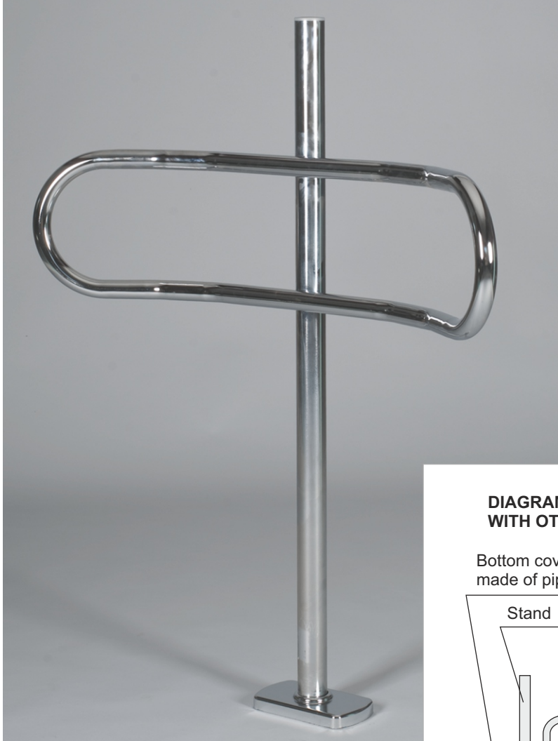
DIAGRAM OF ASSEMBLY OF THE TURNSTILE WITH OTHER ELEMENTS:

Bottom cover for stand made of pipe \varnothing 48 mm