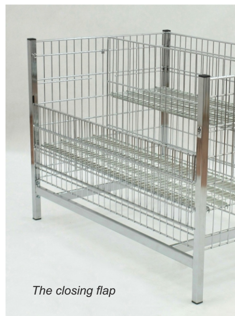
The closing flap

Maximum loading: ca 200 kg (with equable spreading of the goods).