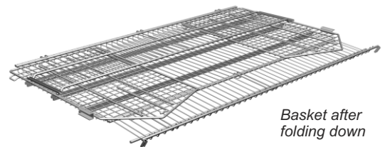
Basket after folding down

Baskets are mainly intended for storage and loose display of fast-rotating goods in stores and supermarkets.