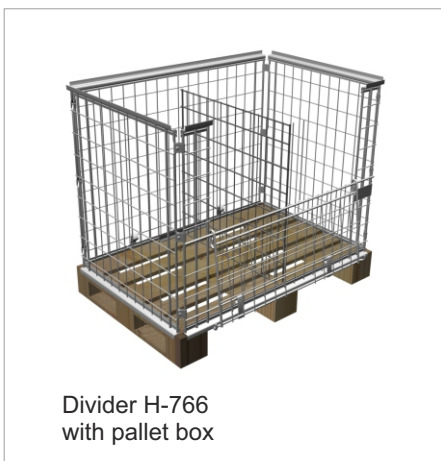
Divider H-766 with pallet box