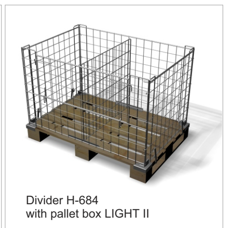
Divider H-684 with pallet box LIGHT II