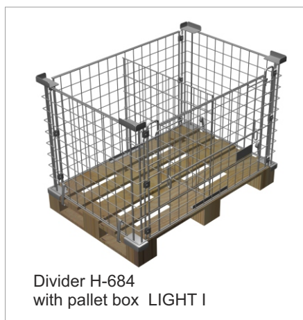
Divider H-684 with pallet box LIGHT I